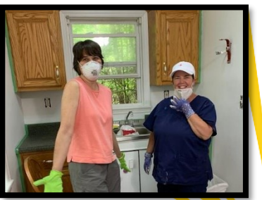
Painting at hermitage

This trip helped me to grow spiritually and form deeper connections with members of our ministry, the church and our community as well as those at the Hinton Center. I am so thankful for that.