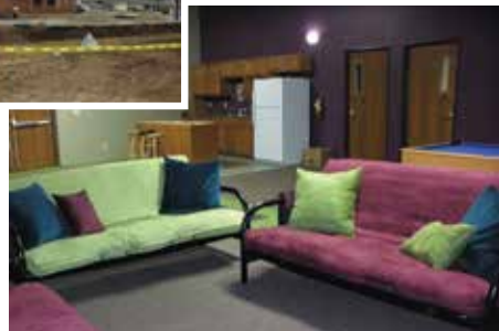
The new youth area and construction site