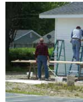
New kitchen & meeting space

After many hours of planning and raising funds, they broke ground on the new addition in 2015. Since the ground